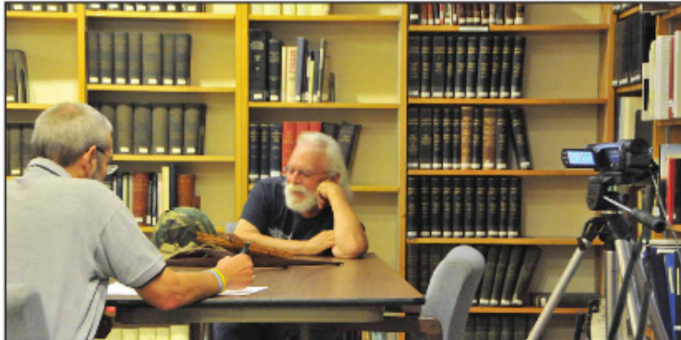
A typical Listening Station session at Cecil County Historical Society.

To share your stories, contact the Cecil County Historical Society at 410-398-1790.